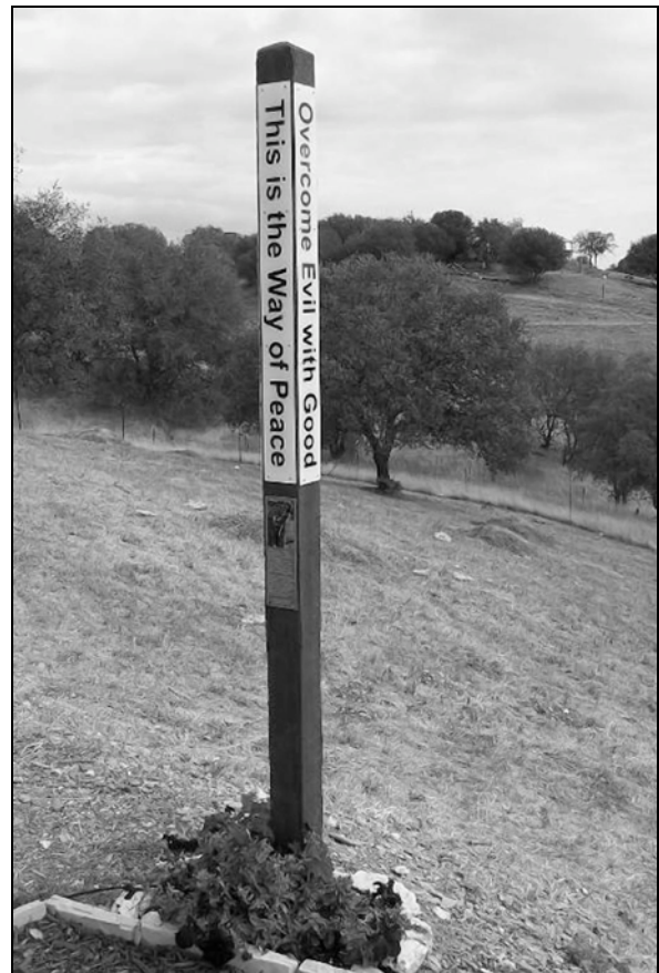
New Peace Pilgrim Pole at Peaceful Pathways